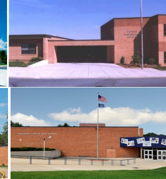
Northern Lehigh High School