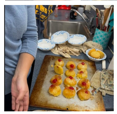
Foreign Language Club students learned to make upside down pineapple cupcakes for their