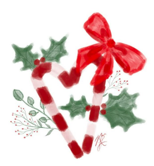
Digital illustrations all designed by Norah Lipsky using Procreate.