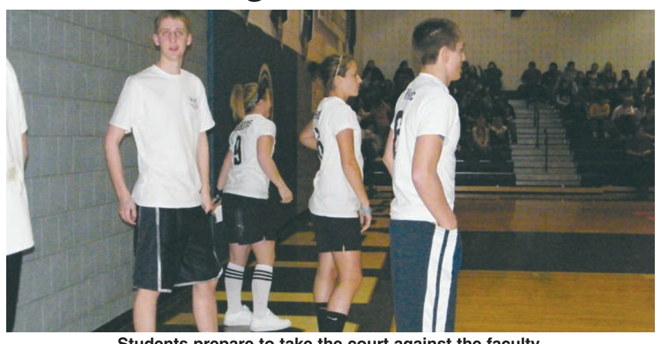
Students prepare to take the court against the faculty.